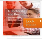
Table of contents (24 chapters)