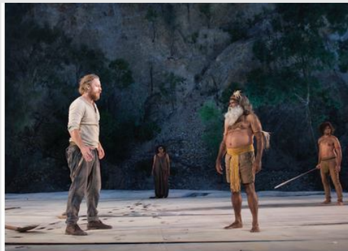
The Secret River at Anstey Hill Quarry.