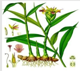
The Ginger Root

Ginger is the rhizome [core of the root] of the plant Zingiber officinale , and has been used by many Asian cultures as food and medicine. It has many entries in the LiveStrong health Website [8].