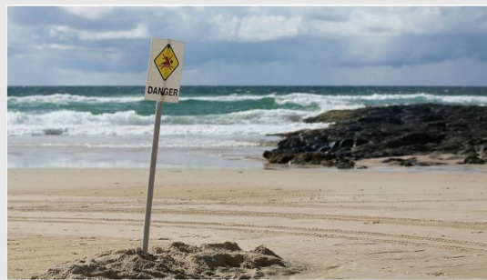
Warning signs at Shelly Beach in Western Australia

Following the death of another surfer in Australia, The Week investigates whether killing sharks reduces the risk of attack