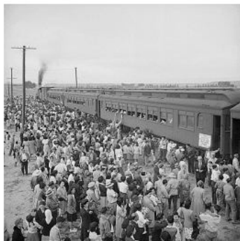
Departure from Heart Mountain concentration camp, Wyoming, July 1945. More info >

The article includes six images. The images are included with more information about that image. Two of those are: