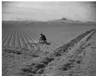
Japanese American working in a field, March 10, 1944, Heart Mountain concentration camp, Wyoming. More info >