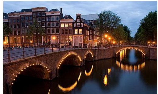
Amsterdam at dusk with a view of the Reguliersgracht at the corner with the Keizersgracht.

Amsterdam is the capital of the Netherlands but seat of the Dutch government is the city of