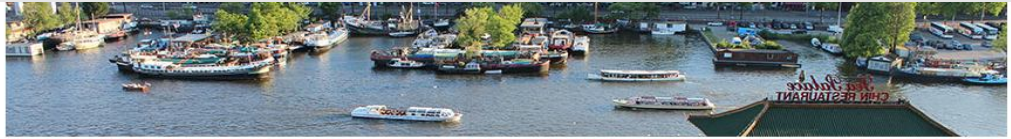
Amsterdam Cityscape towards Oosterdok, seen from the Amsterdam Public Library.

Entries on cities include small coverage about the cities with images and maps and standard time zone.