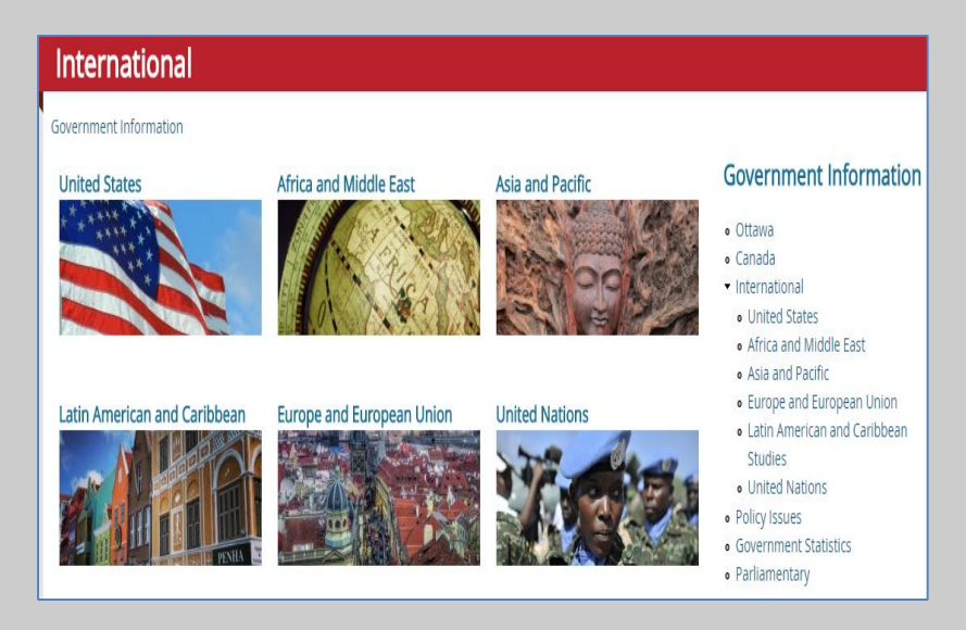
Type of Documents includes Policy issues, Statistics, Parliamentary / Legislation information. Policy issues include access to information, Law, Social, Foreign Affairs, Science and Environment, Population, Labour, Development and Aid, Economy and Public Finance. These categories have so-many sub-categories.

The Jurisdictions link holds information about Ottawa, Canada and International. Each jurisdiction is divided into some topic and sub-topic. Even picture of a sub-topic is given here. Users can select a particular jurisdiction from these three. As for example International is selected. After selection it is seen that there are links of continents with some important pictures of it. International Organisation in a particular interest, foreign government and intergovernmental publications etc. can be access from here. After selecting a particular continent users can see official government resources for that continent.