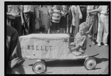
Sample TIFF Photo