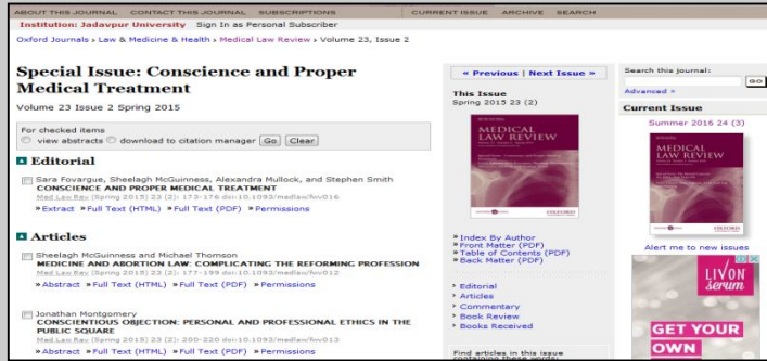
NEW SPECIAL ISSUE ('Conscience and Proper Medical Treatment' 23, 2, 2015)

Apart from that, all issues of Medical Law Review holds information like editorial details, articles, commentary, book review, books received etc in different formats like HTML, PDF etc.